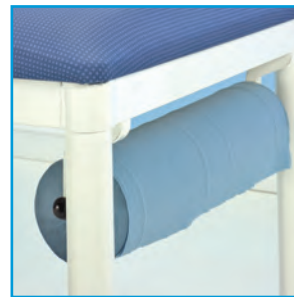
Paper roll holder