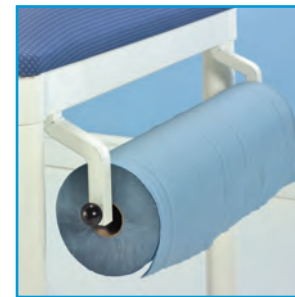
Option of internal or external fitting for paper roll holder