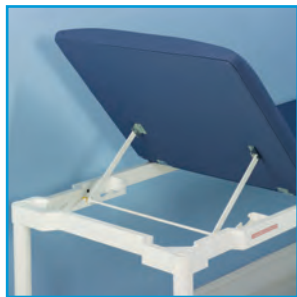
Self locking multi-position adjustable backrest