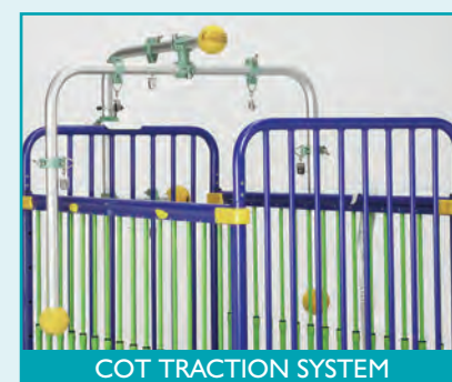
COT TRACTION SYSTEM

Extra Transfusion Poles 9000/DP Oxygen Cylinder Carrier 9000/OX Lockout Box 9000/LOCKOUT