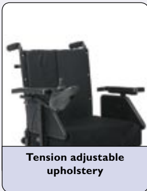
Tension adjustable upholstery

With its centre wheel drive and its compact dimensions, the Pronto M61 gives excellent manoeuvring in very small spaces and has a very tight turning circle. Invacare®'s Sure Step® technology gives a smooth ride over low thresholds of up to 5 cm while maintaining optimum stability at all times. The powerful motors lift the front castors to assist changes in height for a smoother, less jarring ride over rough surfaces.